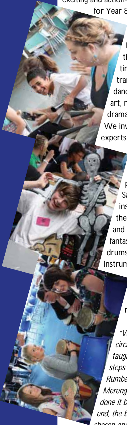
Left: Some Year 8s take part in a drumming class whilst others start working in Art on their 'Day of Dead' skeletons.